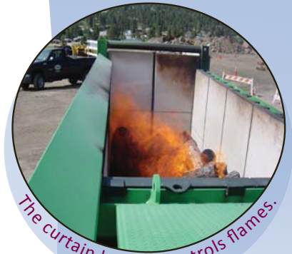
The curtain burner controls flames.