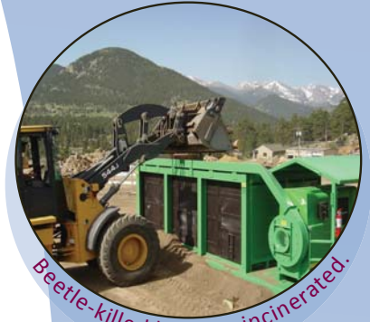
Beetle-killed logs are incinerated.

Beetle Buster inspectors are trained to determine the health of your trees and forest. More information is available by calling 970-577-3588 or by visiting www.estesnet.com/publicworks/Parks/Saveourtrees.aspx