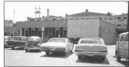
In 1969 cars line the curb in front of the current post office building.

It was in 1941 that the post office moved to its current location on West Riverside Drive, where local residents continue to gather to chat on a daily basis. ■