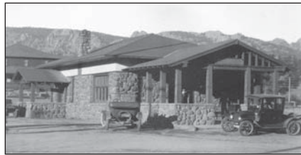
This photo of Estes Park's second post office was taken circa 1914-20.

Due to construction of the Estes Park Hotel, the post office was relocated to a structure on Elkhorn Avenue in 1907. A new wood