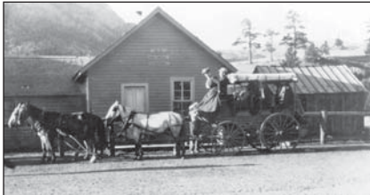
Mail is delivered by wagon to Estes Park's first post office in 1902.